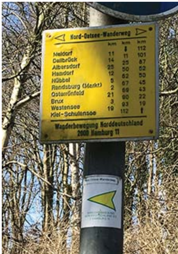
Nord-Ostsee Wanderweg: the first waymark