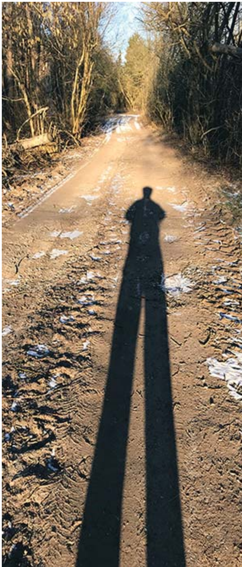
The distance to the next facility casts a long shadow

This point is at the very edge of Kiel, and is a good point to take stock.