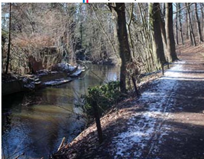
The first acquaintance with the River Eider

7.1 This section of the walk starts from the Eiderbrücke at Schulensee, on Hamburger Chaussee, on the west side of the city of Kiel.