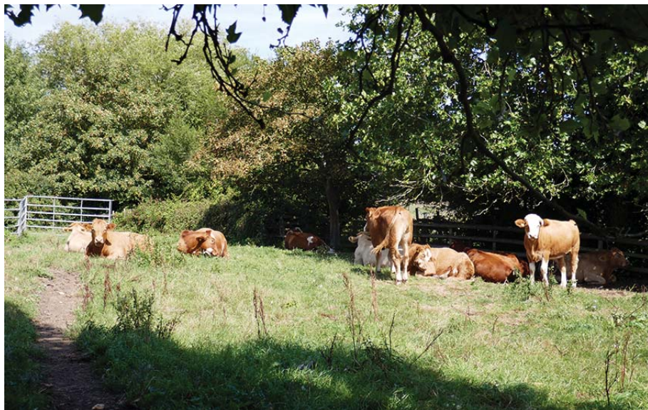
Pasture on exit from Fobbing

of the pasture, follow a path ahead across a field, making for a stile on the left into the next field, where turn right along its right-hand edge, through a slight left bend.