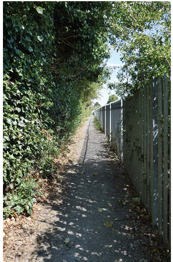
Path from Corringham to Fobbing

At the end of the street, go through a gate and cross the pasture. Beyond the gate on the far side