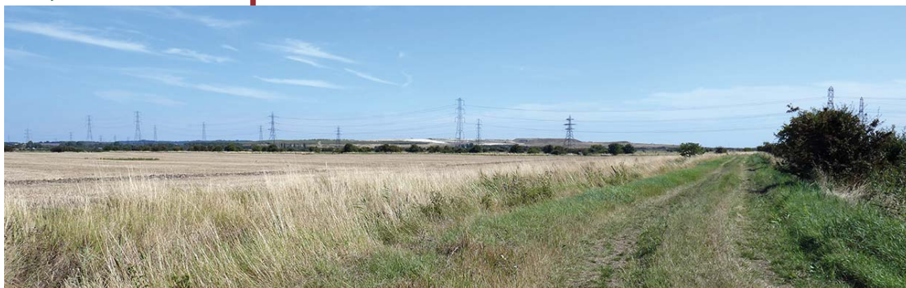
East of Marsh Lane

9 After you have crossed the ditch and gone into the next field, follow the path near the right-hand side of the field, bearing